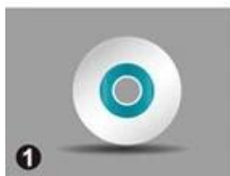
1 Door Lock Software