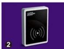
2 RF Card Reader