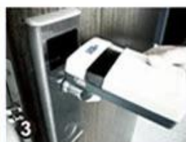
3 Data Collector