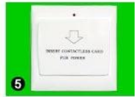
5 Gain Power Switch