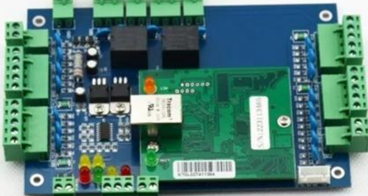
Double door bidirection