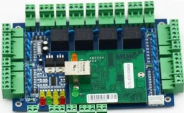
Four door unidirection