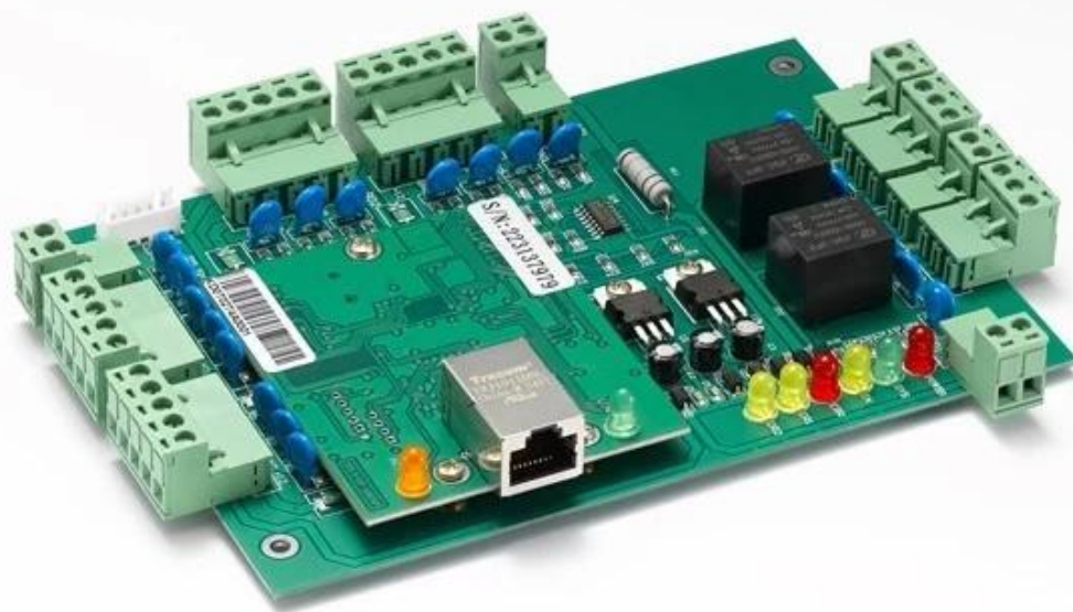
rfid access control system detail picture shoot in kind