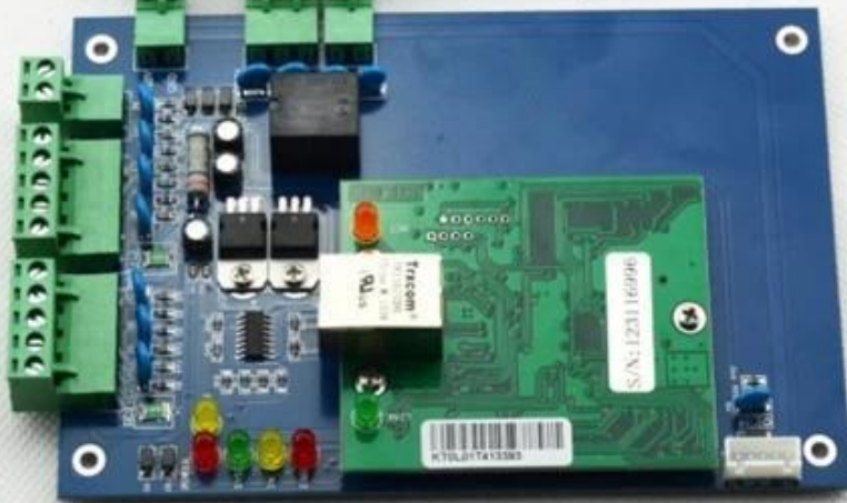
Single door bidirection