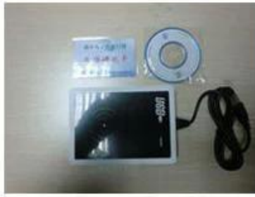
RF card reader (used for issuing room card to guests)