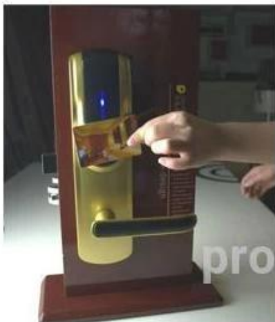
opening the door with RF card