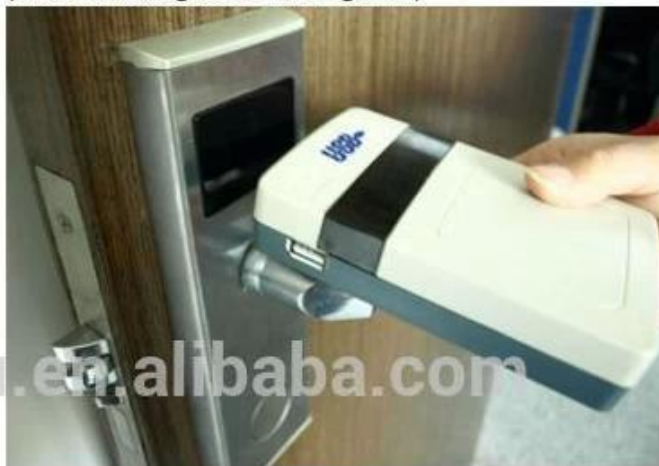
collect opening records from hotel lock