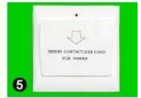
5 Gain Power Switch