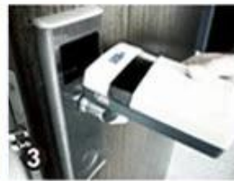
3 Data Collector