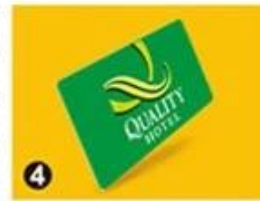
4 RF Card