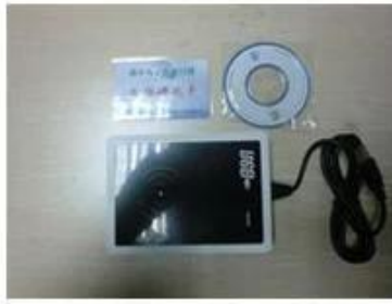
RF card reader (used for issuing room card to guests)