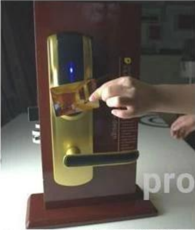
opening the door with RF card