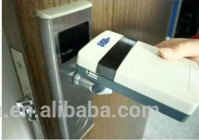
collect opening records from hotel lock

High security Temic card company , Stainless steel Temic card company