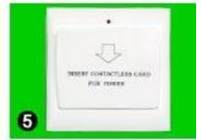
5 Gain Power Switch