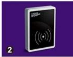
2 RF Card Reader