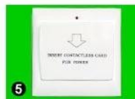
5 Gain Power Switch