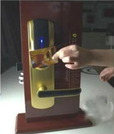
opening the door with RF card