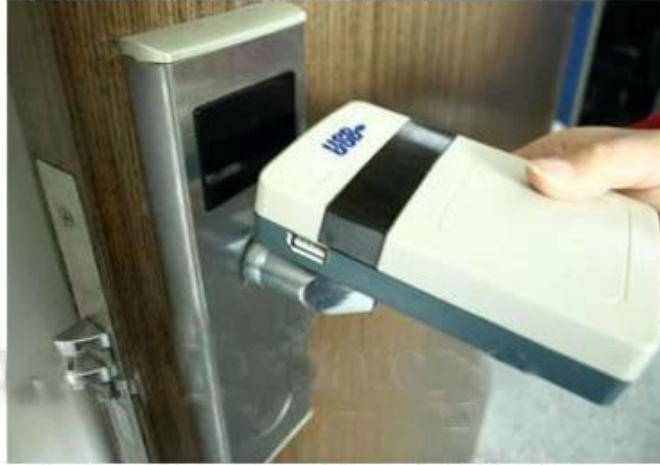
collect opening records from hotel lock